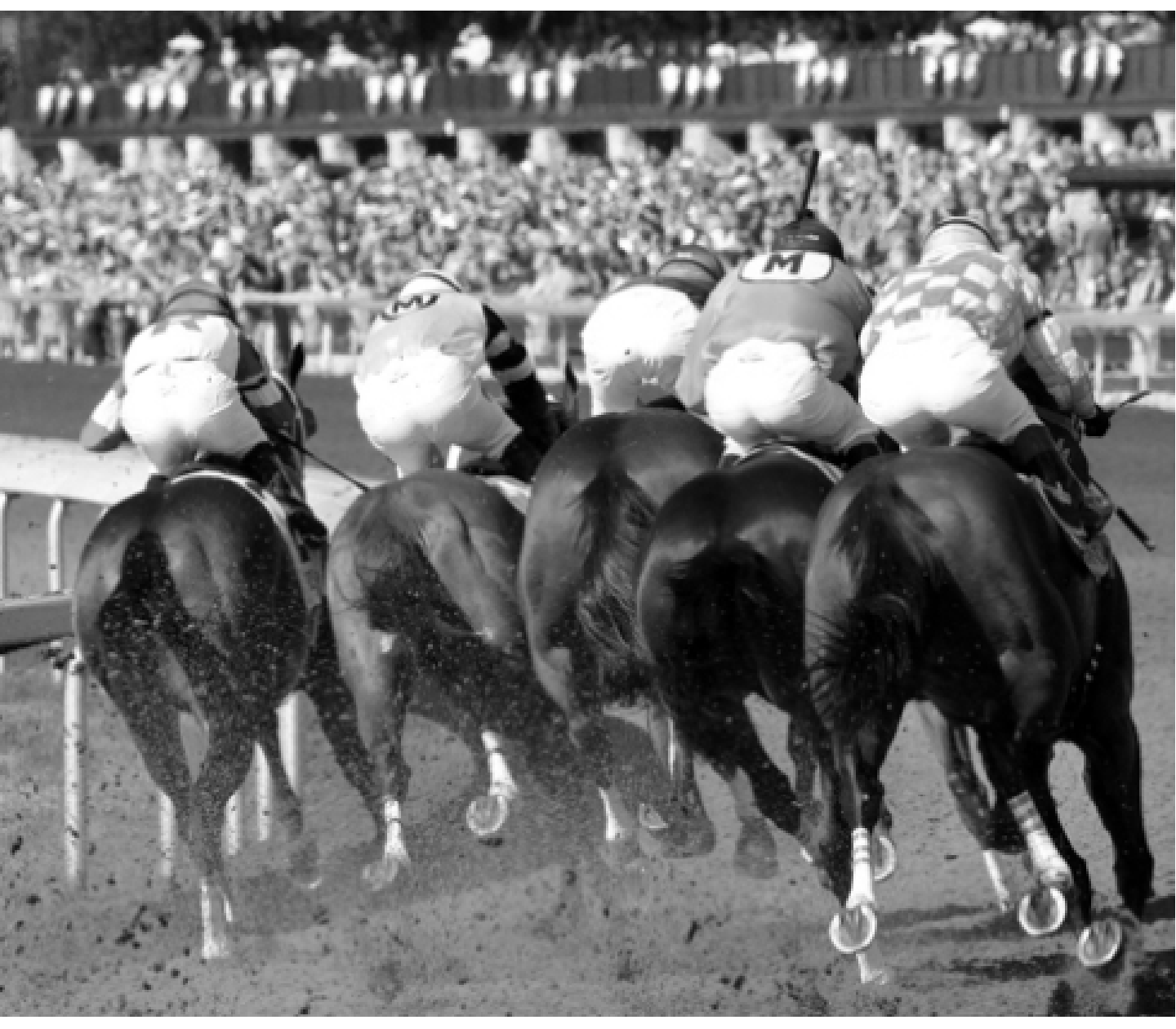
Turning for home at Keeneland. The track has partnered with the Kentucky HBPA and Churchill Downs to generate funds for the Thoroughbred Aftercare Alliance.