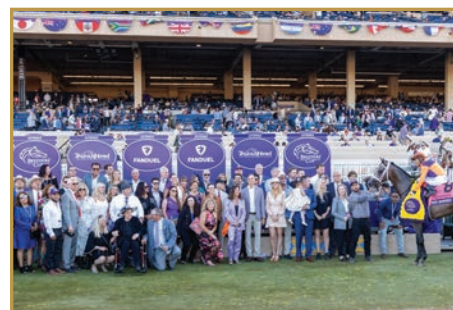
2025 FanDuel Breeders' Cup Juvenile presented by Thoroughbred Aftercare Alliance (G1), won by Ted Noffey