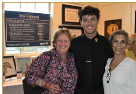
10th Annual America's Best Racing Pre-Preakness Party