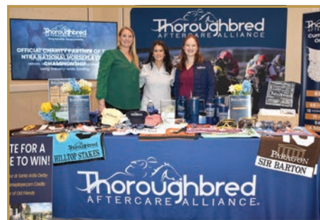
2025 National Horseplayers Championship