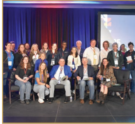
TAA-accredited organizations present at the 2025 IFAR conference

its accreditation and inspection programs.