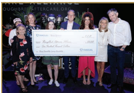
Annual donation from FanDuel