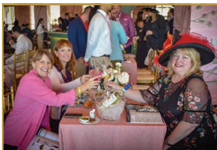
VIP Experience Auction winners at the 2025 Pegasus World Cup.