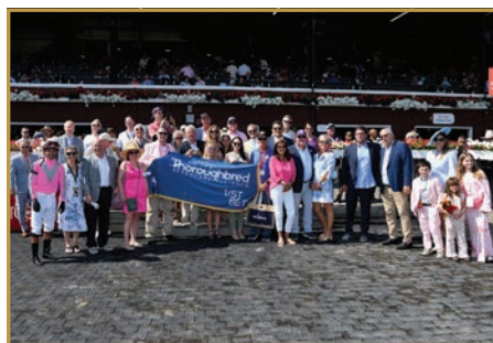
TAA Race on Whitney Stakes Day